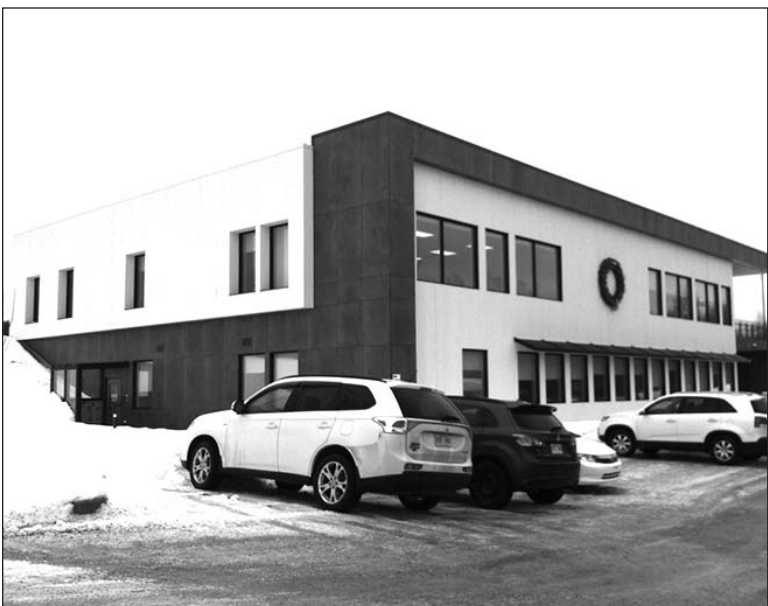
SEGA Building in Chandler.

“Maintaining our seniors at home is a priority for the Québec government and this initiative clearly demonstrates that we are going in the right direction. It’s so important to support, help and treat our seniors. I’m very proud today to inaugurate this building and its unique service on the Gaspé Peninsula,” said Regional Minister, Sébastien Proulx.