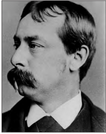
Francis Pharcellus Church

Sinterklaas (as Santa Claus is known in some parts of the world) apparently comes from Turkey and seems to have appeared sometime in the third century. He was originally called Nicolas the Miracle-worker because he is said to have saved a town from starvation and was generous with the poor, placing coins and gifts in the shoes that people left outside their homes. It is said that he eventually moved to Spain, but where and why is a little unclear. While in Spain, Sinterklaas began to keep notes in a large red book (probably his original naughty and nice list) and he began to travel about on a dapple grey horse named Amerigo – his helpers in Spain, called the Pieten, helped him deliver presents through the chimney. While those are his origins, Santa Claus, has many forms and many traditions around the world. In Denmark, Julemanden (Christmas Man) travels by reindeer and works