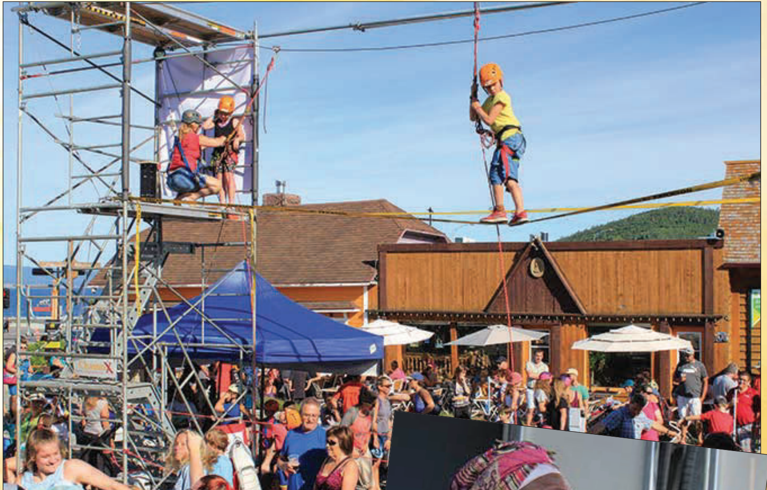
The slack line installed at the east end of Queen Street was a big drawing card for the children.

It’s harder to estimate the crowds on Queen Street because the shows and activities are free, however,