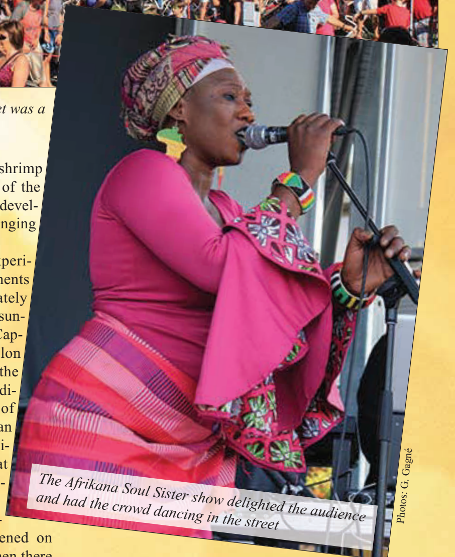
The Afrikana Soul Sister show delighted the audience and had the crowd dancing in the street

Another memorable moment happened on Sunday afternoon when there was an electrical blackout during the concert of Italian group Kalascima, which was performing on a Queen Street stage. The six musicians kept smiling and asked the audience to gather closer to them. The show went on in an acoustic version.