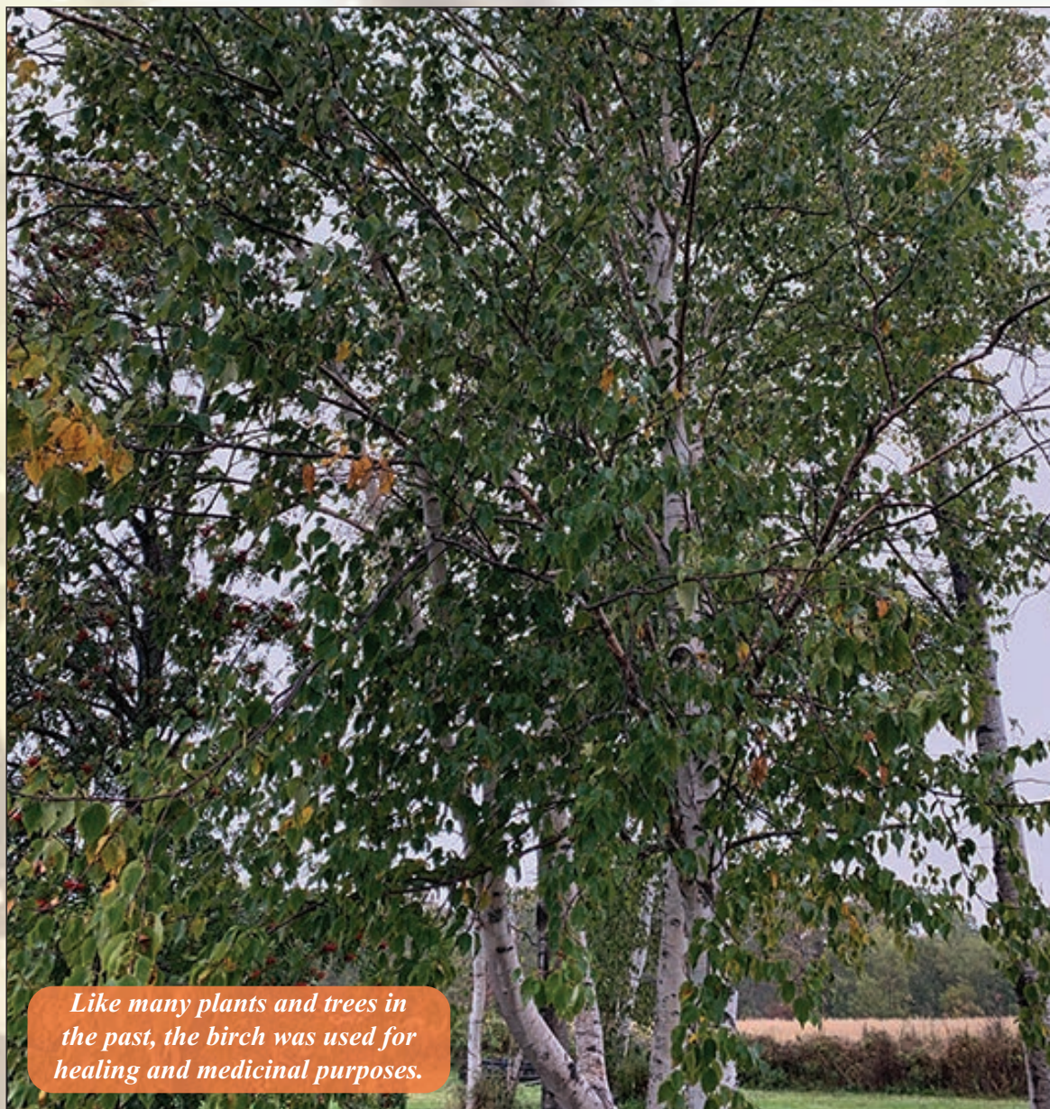
Like many plants and trees in the past, the birch was used for healing and medicinal purposes.

Scandinavians use a bundle of birch tied together in the sauna, which they slap themselves with to stimulate