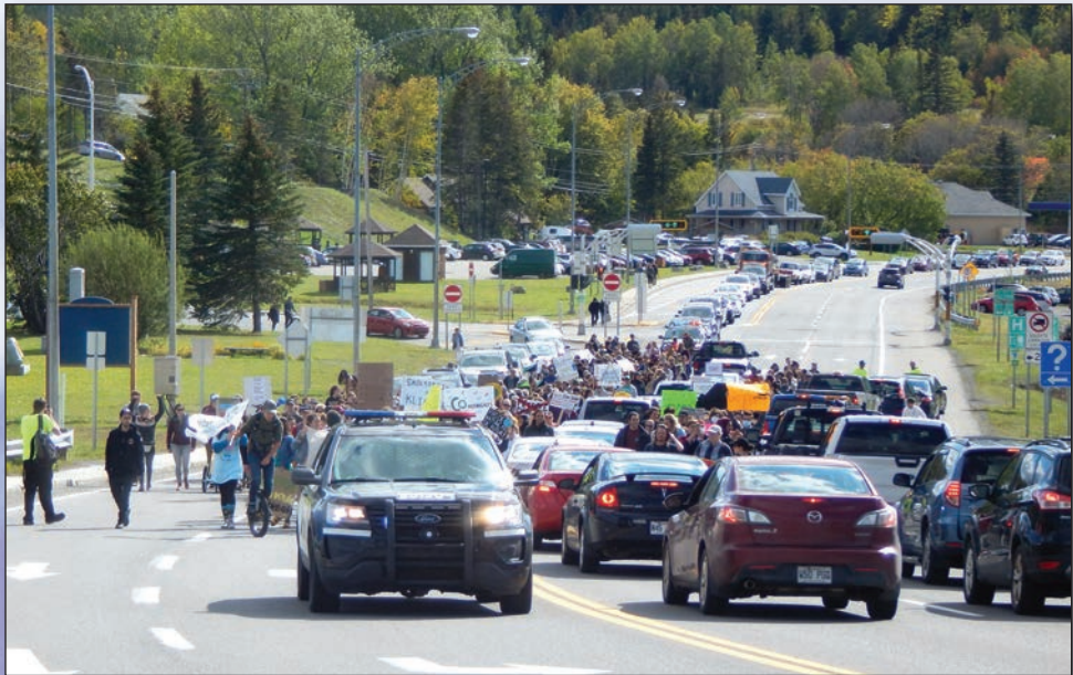
Motorists were detained by the climate walk in Gaspé.