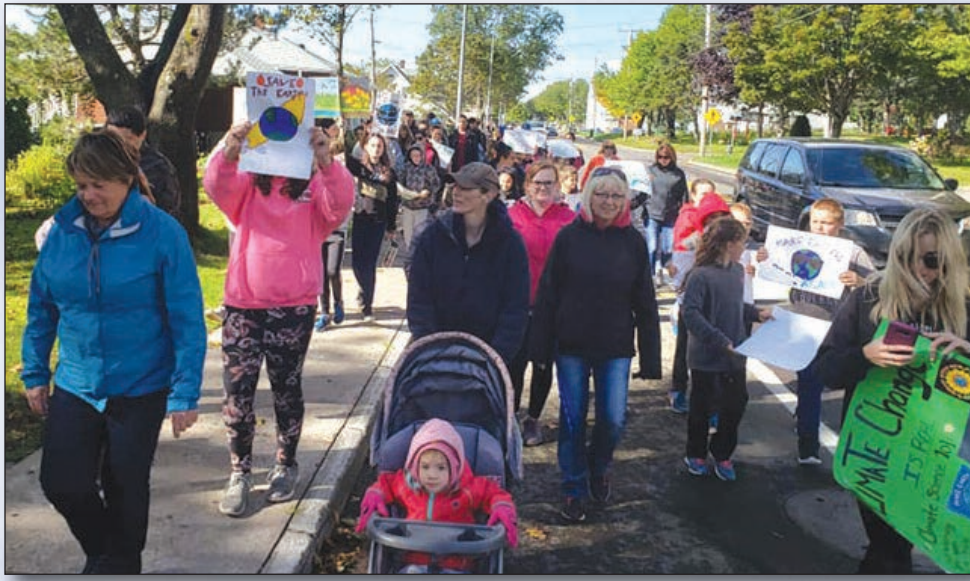
NCHS, joined by New Carlisle residents, held its own climate walk.