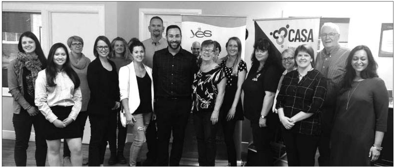
YES representatives joined by local partners and entrepreneurs at ELLEvate program launch in New Carlisle.

From 2015-2017, emerging entrepreneurial activity was 8.3% higher among Quebec