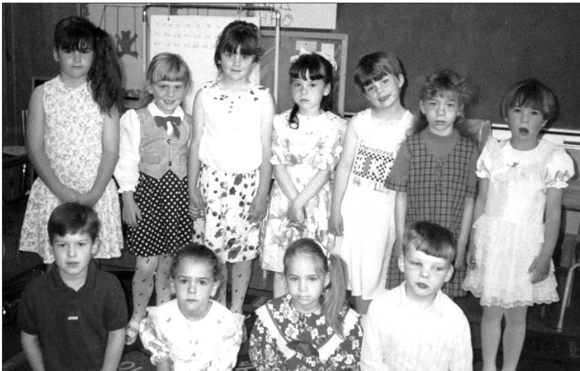
New Carlisle High School Kindergarten - 1992-93

We urge all teachers on the Coast to please send or email their old class pictures to share with our readers.