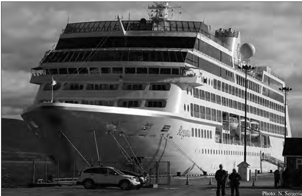
27 cruise ships are expected this summer in Gaspé.

The truckers' position was reiterated in a press release on March 22.