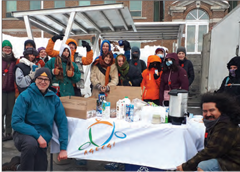
Nearly 20 students demonstrated in front of the René-Lévesque pavilion in Gaspé on the morning of March 22.