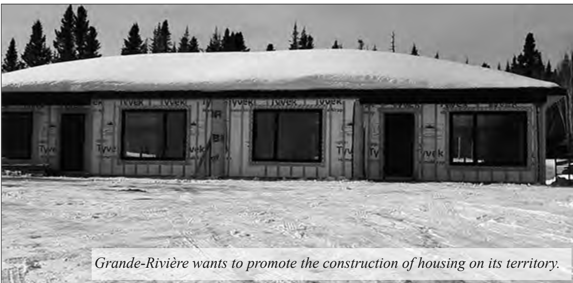
Grande-Rivière wants to promote the construction of housing on its territory.

"We reminded the Minister (Andrée Laforest), just as we reminded the Minister of Finance, that these envelopes had to be increased in the next budget and we hope for convincing results. Beyond that, there is still the problem of developing social housing which requires large investments. The (social housing) project is extensively documented. Now it has to land on the ground," concludes the prefect.