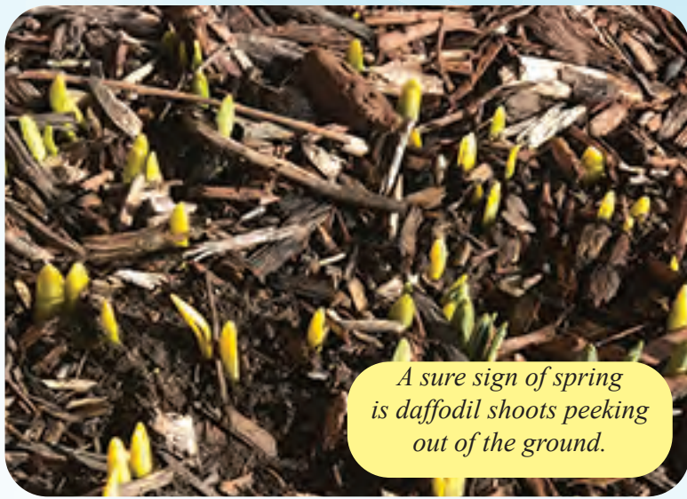
A sure sign of spring is daffodil shoots peeking out of the ground.

After March 20, the Northern Hemisphere begins to tilt more toward the sun