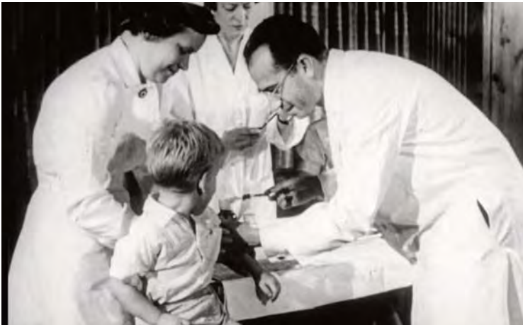
Thought to be a disease of the past, polio has re-emerged after being virtually eradicated thirty years ago.