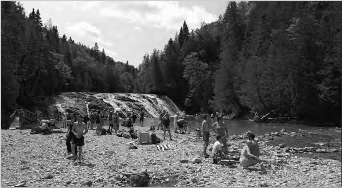
The river is a well-attended spot on sunny summer days.