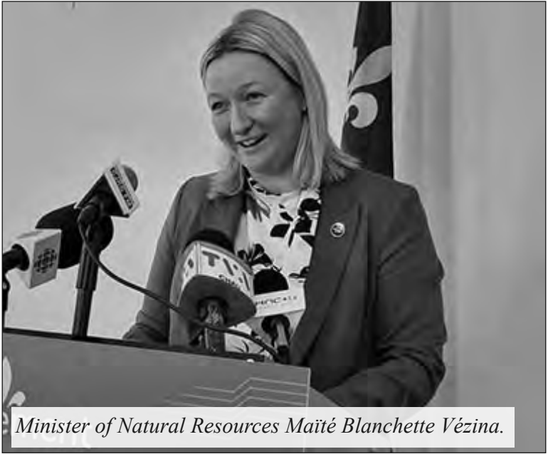
Minister of Natural Resources Maïté Blanchette Vézina.

Another capture operation is planned for the winter of 2025, to continue deploying telemetric collars.